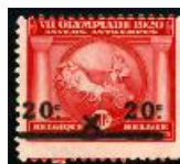
2). " X " cover the old values