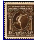
15c (15c + 5c) A runner

As the War was just finished, the economy was yet to recover. People were unemployed. Some even became paralyzed during the War. Those paralyzed people needed subsidies from the Government. Funds were urgently needed. As a result, for each of the values, a 5c-surcharge was added. Since the printing house in Belgium was destroyed during the War, the Belgium post authority had to entrust the American Bank Note Company of New York to print the stamps. According to the former research, the number of stamps issued was as followed :