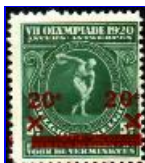
1). " 20 c " new value