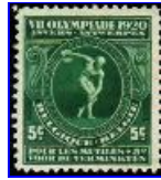
5c. (5c + 5c) A Discus Thrower