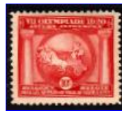
10c (10c + 5c) A Chariot