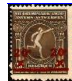
3). " - " cover the surcharge wording